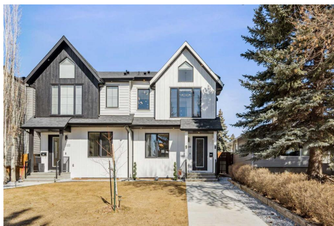
2130 53 Ave SW, Calgary, AB

Main Floor Exterior Area 949.36 sq ft Interior Area 678.23 sq ft